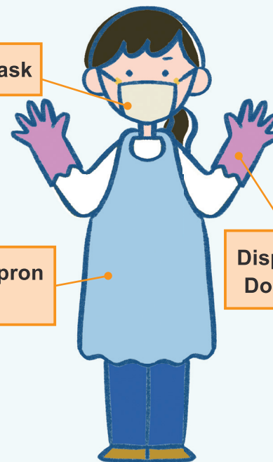
Protective or apron (plastic)